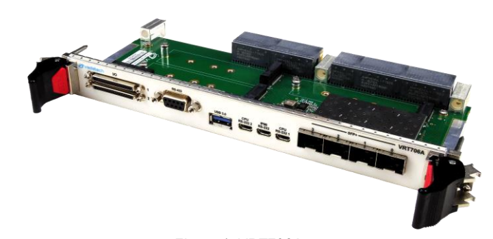
Figure 1: VRT706A

The VRT706A provides an easy access to the I/O ports routed to the P1/P2/P3 and P5 connectors of the VPX706. These includes Quad SFP+, USB, RS-232, NVMe M.2 style storage, as well as I/O expansion to P3/P5.